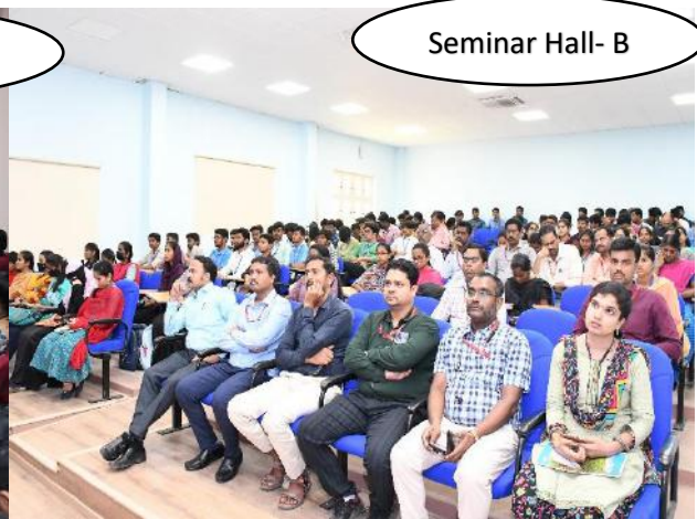
Seminar Hall- B