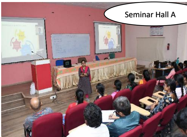
Seminar Hall A